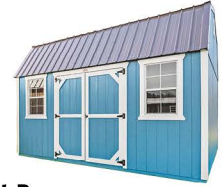
Side Lofted Barn