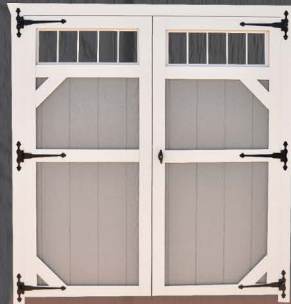
DOUBLE DOOR WITH TRANSOM WINDOWS