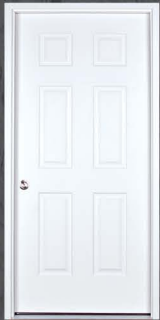
6-PANEL DOOR 36" x 70"