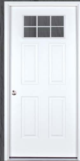
6-LITE DOOR 36" x 70" / 36" x 78"