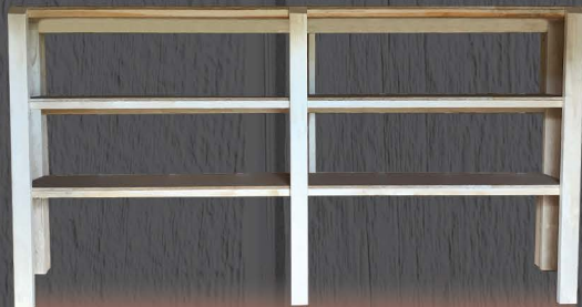
SHELVES (3 TIER, 16" DEEP, 60" HEIGHT)