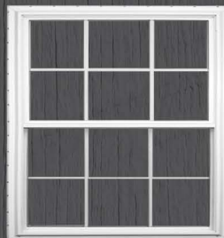
3x3 WINDOW BLACK OR WHITE GRID