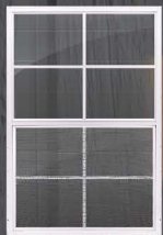
2x3 WINDOW BLACK OR WHITE GRID