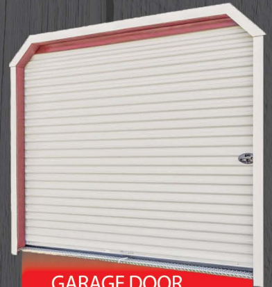
GARAGE DOOR (6' & 9' OPTIONS)