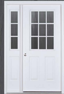
9-LITE PREHUNG WITH SIDELIGHT 54" x 78"