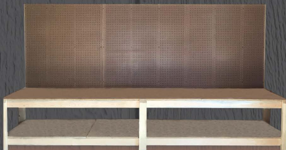
PEG BOARD & WORKBENCH (24" DEEP, 36" HEIGHT)