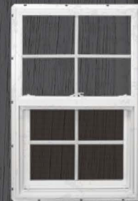
THERMAL WINDOWS 2x3 / 3x3 / 3x4 WHITE GRID ONLY