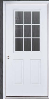
9-LITE DOOR 36" x 70" / 36" x 78"