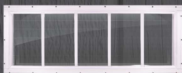
TRANSOM WINDOW BLACK OR WHITE GRID