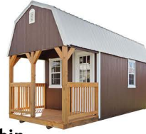
Lofted Barn Cabin