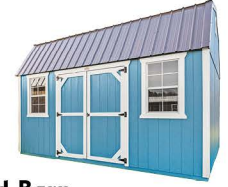
Side Lofted Barn