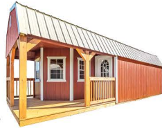
Deluxe Lofted Barn Cabin